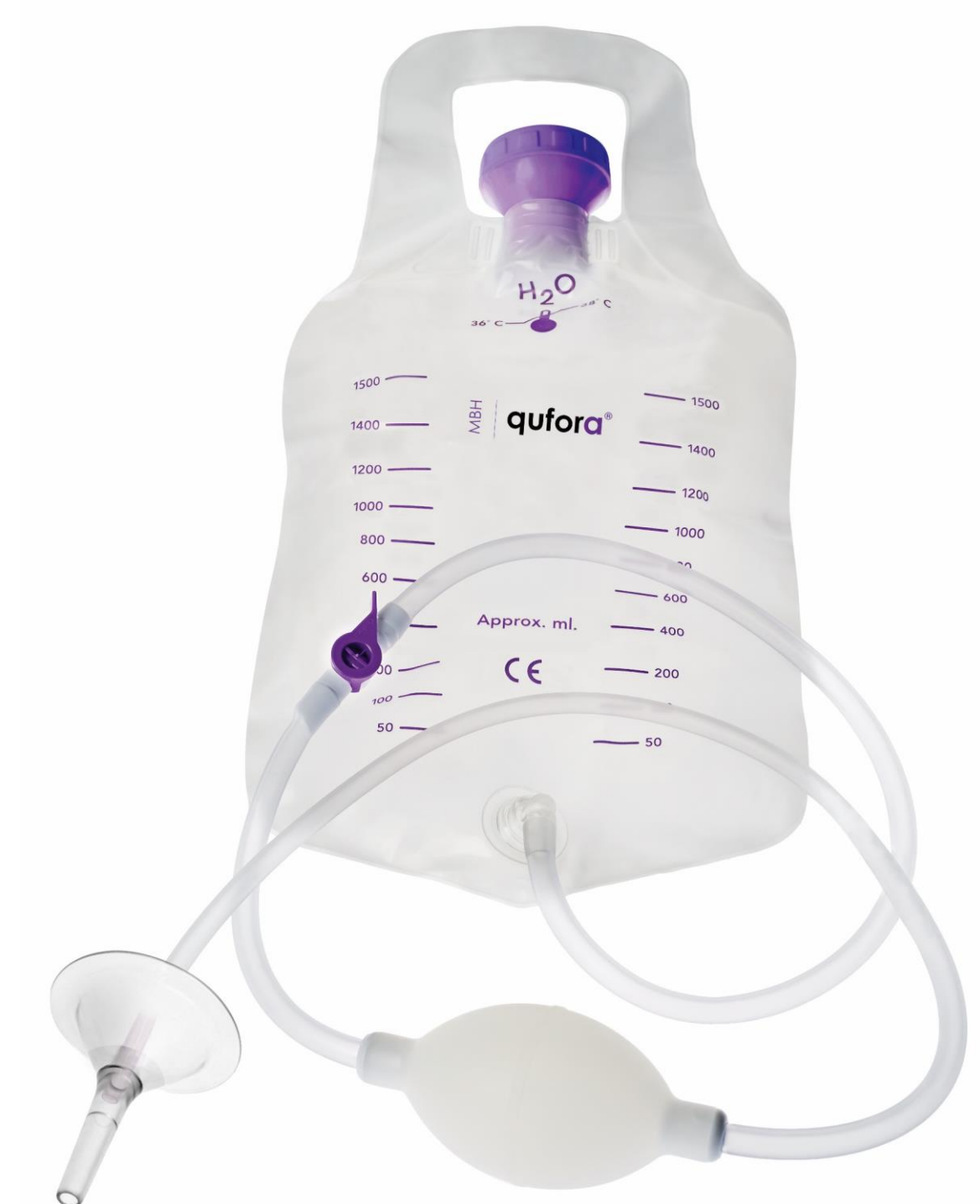
Figure 2: The Qufora® IrriSedo Cone System